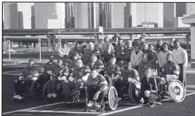
ASPIRE HOUSTON: AAASP athletes, parents, staff and the Houston skyline outside Houston's Fonde Community Center

The Houston Parks and Recreation Department served as host to ASPIRE