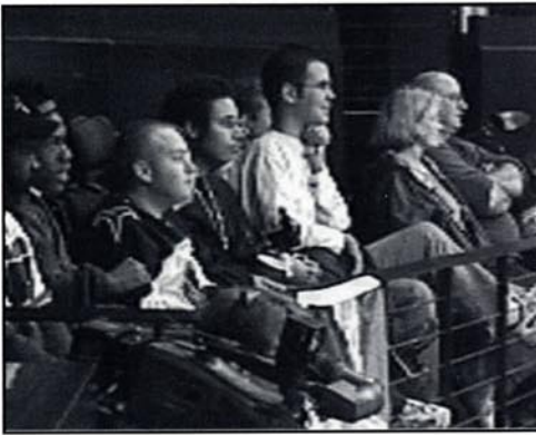
AAASP Athletes riveted to the action between the Atlanta Thrashers and the Chicago Blackhawks on Adapted Sports Night.

The NHL Atlanta Thrashers, demonstrate their community commitment by naming December 14 at Phillips Arena Adapted Sports Night , with more than 150 AAASP youth athletes and guests attending the matchup between the Atlanta Thrashers and the Chicago Blackhawks.