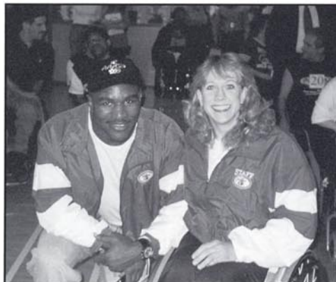
Evander Holyfield and Jean Driscoll at ASPIRE Houston

W orld-acclaimed athletes Evander Holyfield and Jean Driscoll teamed up with AAASP on January 17 in Houston at the Fonde Community Center to present ASPIRE Houston , the kick-off to the adult Indoor Wheelchair Soccer National Championships. Holyfield is National Spokesperson for AAASP and served as the IWS Nationals Honorary Chairperson; Driscoll is AAASP's ASPIRE Project Spokesperson and Board member.