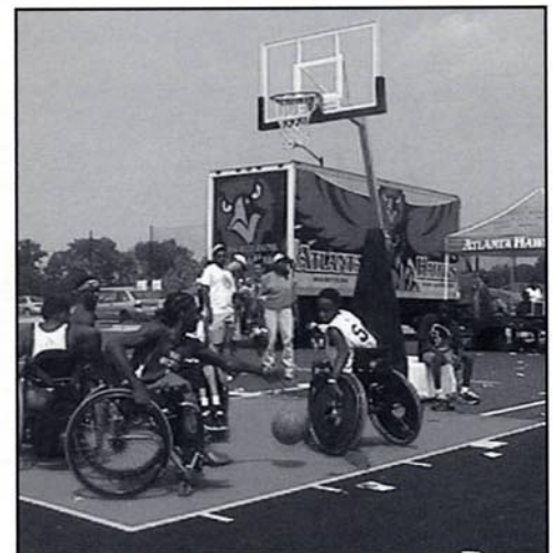
AAASP's Team Holyfield picks up a game during The Holyfield Foundation's KIDSFEST celebration.