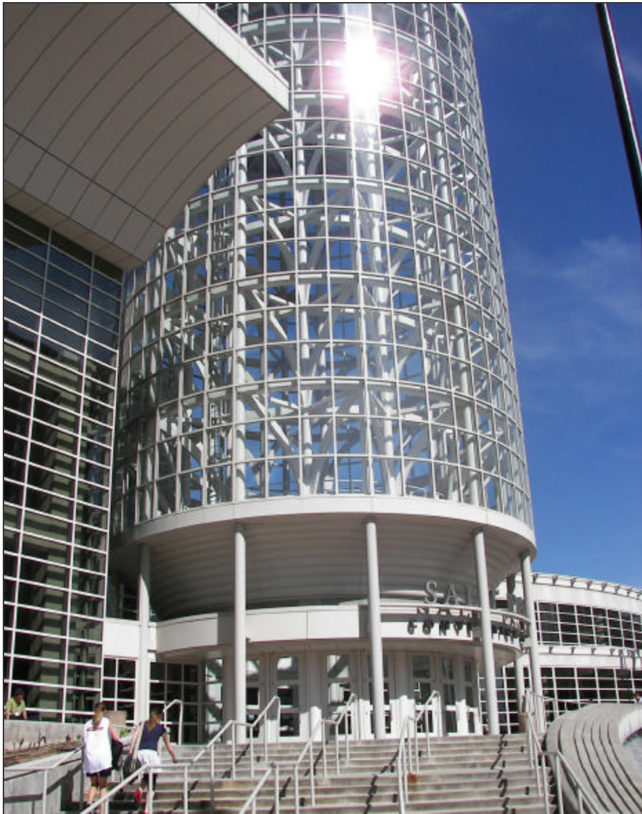
The Salt Palace stands proud in majestic white against Utah royal blue at the 2006 AAPERD National Conference in Salt Lake City in late April.

National honors are bestowed upon the American Association of adaptedSPORTS™ Programs (AAASP) for its success in providing athletic opportunities to students with physical disabilities or visual impairments.