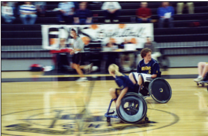
High-speed action at the 10th AAASP Georgia IWS Championships.