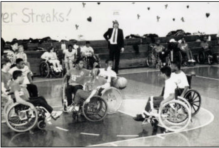
The DeKalb County School System supports Georgia's first adapted sports teams, the Silver Streaks and the Red Hot Rollers.